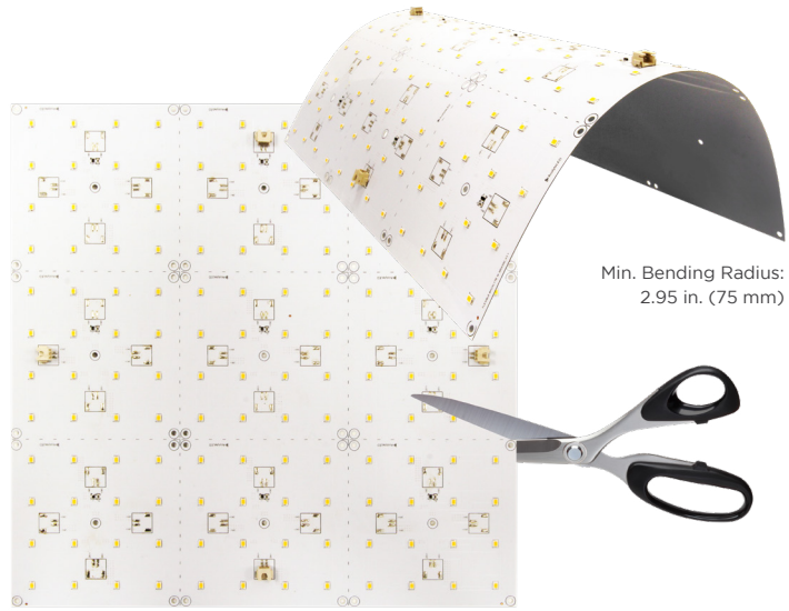
Min. Bending Radius: 2.95 in. (75 mm)

COMMERCIAL | ENTERTAINMENT | HEALTHCARE | HOSPITALITY | MUSEUMS | PUBLIC SPACES | RESIDENTIAL | RETAIL