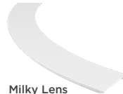
Milky Lens 74% Light Transmission