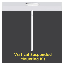
Vertical Suspended Mounting Kit