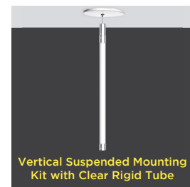
Vertical Suspended Mounting Kit with Clear Rigid Tube