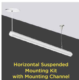
Horizontal Suspended Mounting Kit with Mounting Channel