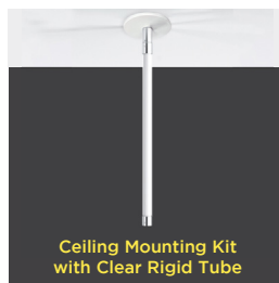
Ceiling Mounting Kit with Clear Rigid Tube