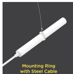
Mounting Ring with Steel Cable