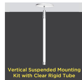
Vertical Suspended Mounting Kit with Clear Rigid Tube