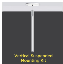
Vertical Suspended Mounting Kit