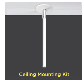
Ceiling Mounting Kit