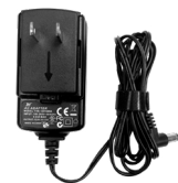
Plug-in Driver (included)