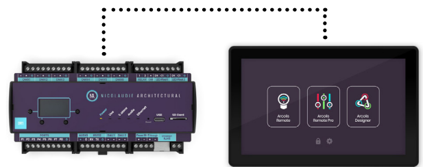
2 Universe DMX Controller Part Number: DMXCTRLDR2U