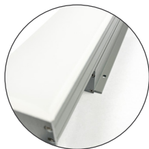
Fixed Mounting For mounting without adjustable angles